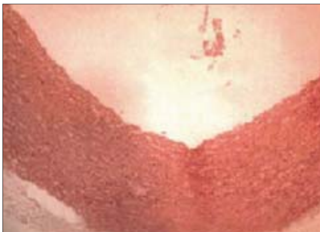
Fig. 2: Histological view of the aortic strips of hypercholesterolaemic rabbits treated with amla extract (10 mg/kg body weight).

Rabbits were made hypercholesterolaemic by feeding cholesterol powder (100 mg/kg body weight) for a period of 4 mo. Amla extract 20 mg/kg was administered to rabbits for 4 mo. After the experimental period, rabbits were sacrificed and histology of the aorta was studied as described in the text. Figure shows normal aortic lumen size as in the control group A.