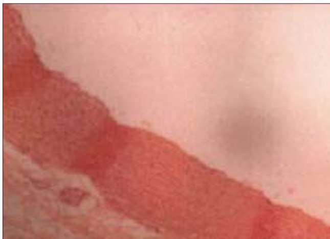
Fig. 1: Histological view of the aortic strips of rabbits in control group A.

rabbits produced significant elevation in the levels of serum total cholesterol, LDL and triglycerides. Administration of amla extract orally in the dosage of 10 and 20 mg/kg produced significant antihypercholesterolaemic effect in these experimental animals. The rabbits of untreated hypercholesterolaemic control group did not show marked decrease in serum cholesterol, LDL, VLDL and triglyceride levels, while animals of treatment group