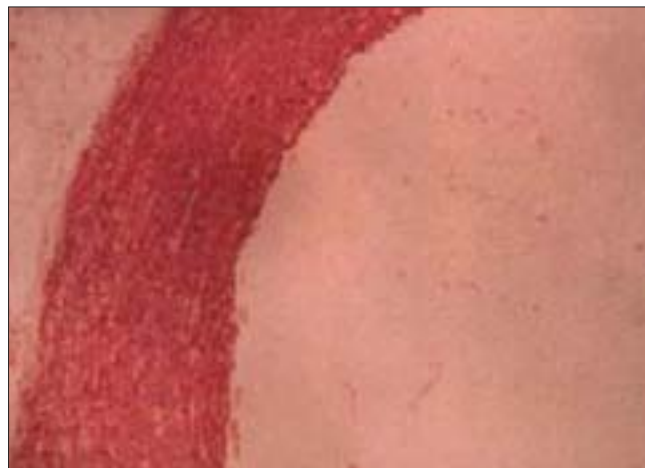
Fig. 3: Histological view of the aortic strips of hypercholesterolaemic rabbits treated with amla extract (20 mg/kg body weight).

Rabbits were fed with normal diet and treated as control group. After the experimental period, the animals were sacrificed and sections of aortic strips were taken for histological studies as described in the text. The figure shows normal aortic lumen size.