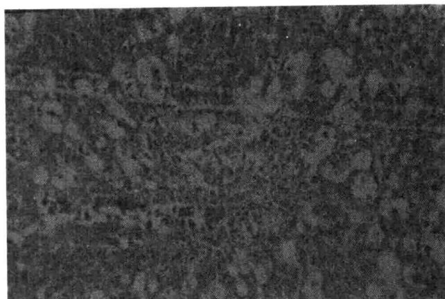
Fig. 2: Alum-Haematoxylin & Eosin 10X10x=100x

Lipid peroxidation is a complex and natural deleterious process. The significant increase observed in levels of lipid peroxides in liver of \text{CCl}_4 -treated animal shows free radical induce liver damage 12 , while the animals