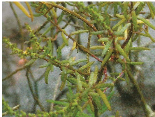
Fig. 1: Suaeda maritima L (Dumort), Chenopodiaceae family collected from Indian Sundarbans

S. maritima plant was collected from Bonnie camp of Sundarbans (21°49'53.581" 0 N latitude and 88°36'44.860" 0E longitude) on August, 2015. The plant was authenticated as S. maritima by Botanical Survey of India, Apex Research Organization under the Ministry of Environment and Forests, Govt. of India (fig. 1). The shoots were collected, cut into small pieces and air dried in the shade. The dried plant material was ground to a coarse powder by mortar and pestle.