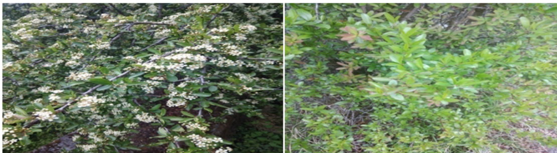
Fig.1: Pyracantha crenulata plant

The dried powder of leaves (100 g) was successively extracted by cold maceration three times with 400 ml of 25 % ethanol and kept for 24 h. Each time with